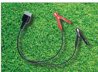
55cm Lead to Positive / Negative Battery Clamps