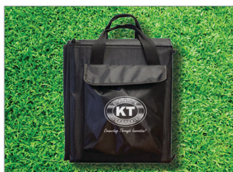
Easy transportation & storage