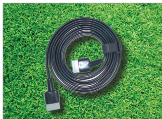
5M Power Lead