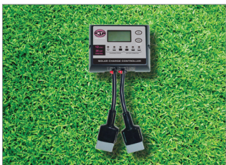
20A Solar Charge Controller