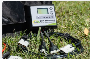
20A 12V PWM SOLAR CHARGE CONTROLLER Displays battery voltage, battery capacity percentage & amp hours.