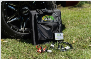
FOLDS DOWN TO A CONVENIENT CARRY BAG Storage compartments for all leads & accessories.