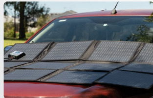
FLEXIBLE POSITIONING Lay flat or hang via corner eyelets for maximum solar positioning.