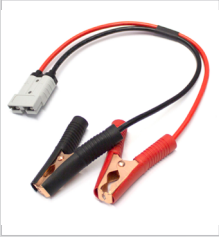
50A Heavy Duty Connector To Positive/Negative Battery Clamps, 550mm Lead