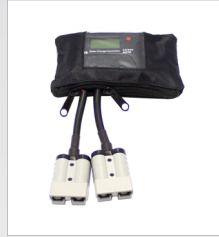
10A, 12V PWM Solar Controller with 220mm Leads to 50A Heavy Duty Connectors