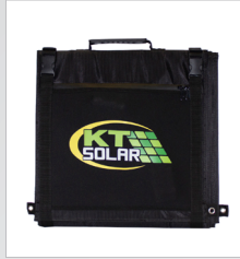
Easy-Carry Storage Bag with compartments for accessories