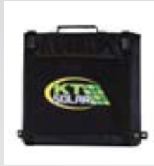
Easy-Carry Storage Bag with compartments for accessories