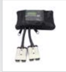
10A, 12V PWM Solar Controller with 220mm Leads to 50A Heavy Duty Connectors