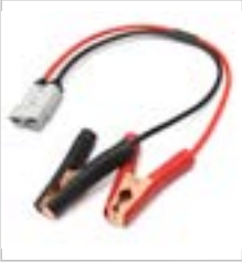
50A Heavy Duty Connector To Positive/Negative Battery Clamps, 550mm Lead